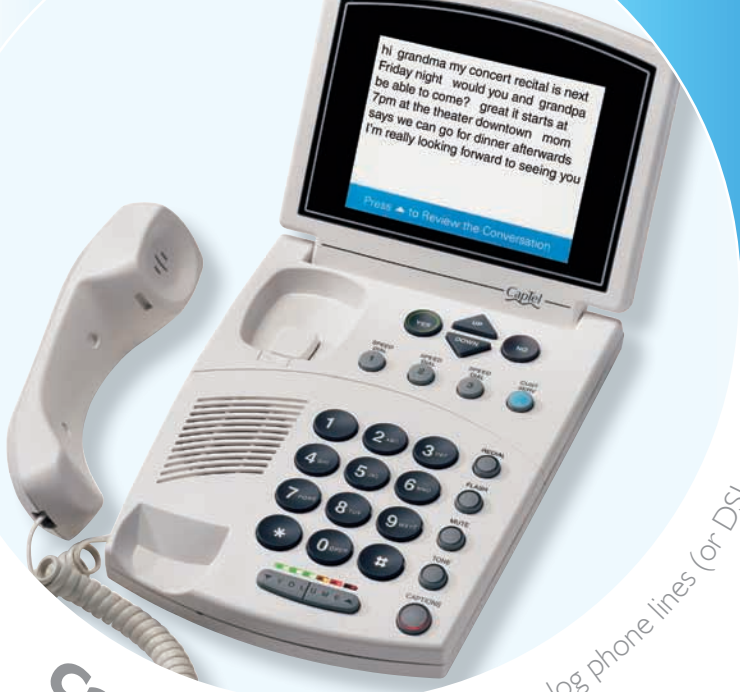
CapTel 800 – for use with analog phone lines (or DSL with filter)